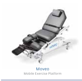
MOBILE EXERCISE PLATFORM