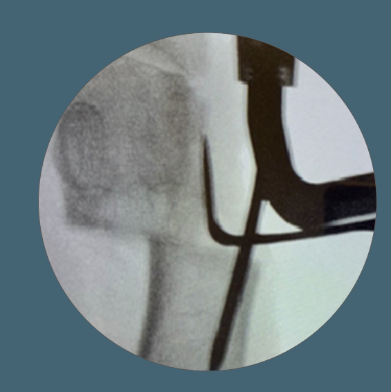
CONTROLLED TRI-PLANAR CORRECTION

The freedom paddle offers full tri-planar control to the surgeon. With the device positioned medially, the surgeon has the freedom to manipulate the transverse, frontal, and sagittal planes, in addition to the DMAA, which would otherwise be limited by a transfix pin into the head.