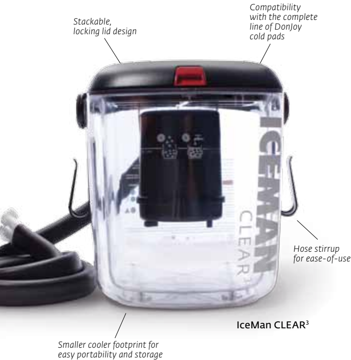
IceMan CLEAR 3

The IceMan CLEAR 3 cold therapy unit helps reduce pain and swelling, speeding up rehabilitation. The IceMan provides extended cold therapy for a variety of indications and protocols as directed by a medical professional. It utilizes DonJoy's patented semi-closed loop recirculation system , which maintains more consistent and accurate temperatures than other cold therapy units, in a preset configuration .