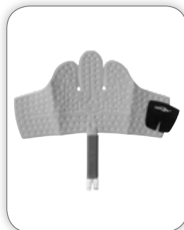
Ankle Wrap-On Pad (Includes IceMan Cooler)