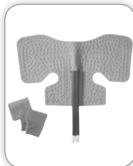
Shoulder Wrap-On Pad (Includes IceMan Cooler)