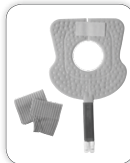
McGuire Knee Wrap-On Pad (Includes IceMan Cooler)