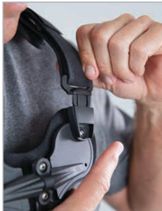
Quick release shoulder buckles simplify donning and doffing.