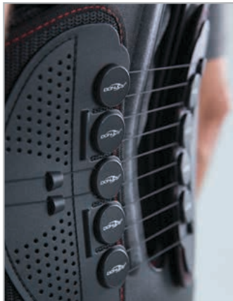
Patented Mechanical Advantage Pulley System easily adjusts trunk compression.