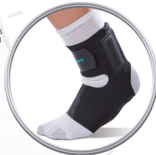
AirHeel with Stabilizers