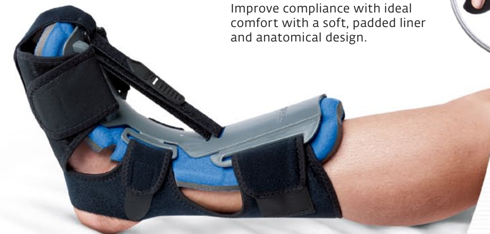
Dorsal Night Splint