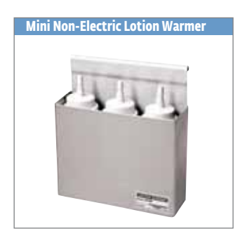
Hangs on the front of the Hydrocollator E-l or E-2 heating unit and uses the unit's warmth to keep lotion or gel at a comfortable temperature. Bottles are not included.