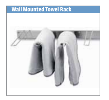
Six hooks extend 13" (33 cm) from wall. Measures 2" x 33" (5 cm x 84 cm).