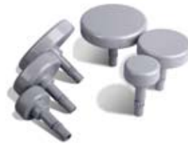
Capacitive Electrodes 80mm, 120mm, and 165mm

The body part is treated within the electromagnetic field of two plate electrodes, which warms superficial and high density tissues such as skin, tendon, ligament, joint capsule and bone more effectively. Capacitive electrodes require optional left side electrode arm (14790).