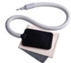
Flexible Rubber Electrode with felt layer