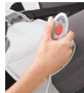
Patient Interrupt Switch