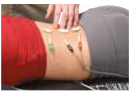
sEMG Initiated Traction (optional)