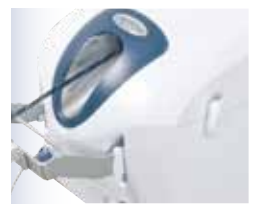
Visual Rope Angle