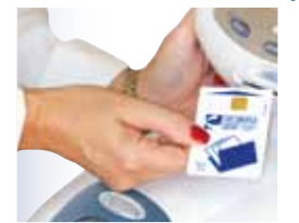
Patient Data Card