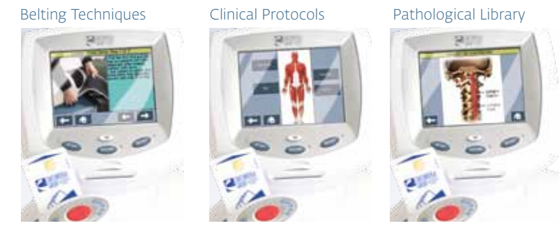
Full Color Clinical Graphic