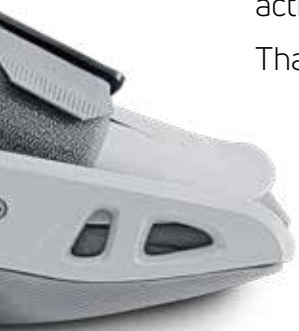
Aircast® AirSelect™ Short