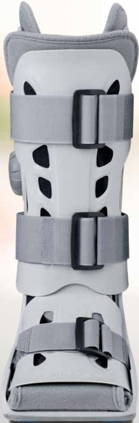
Aircast® AirSelect™ Elite