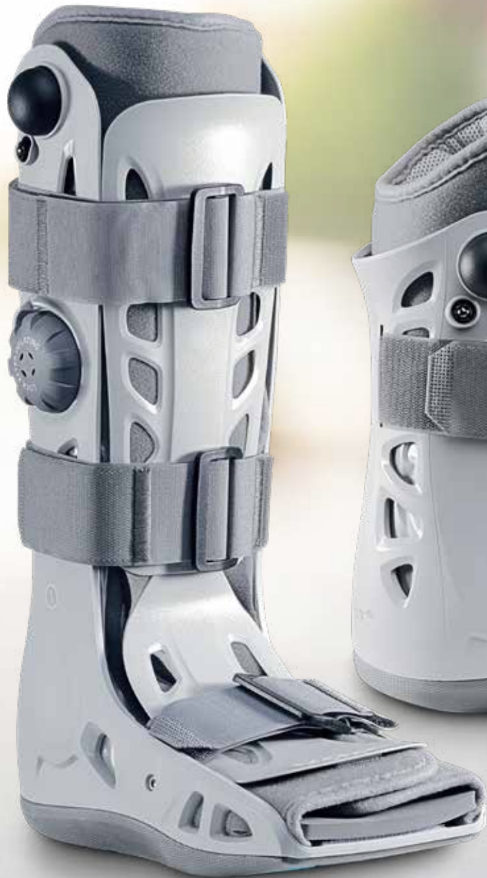
Aircast® AirSelect™ Standard